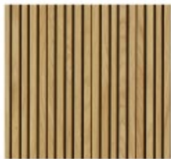
LINE FLEX - INVISIBLE

Our acoustic panels are available in one colour: